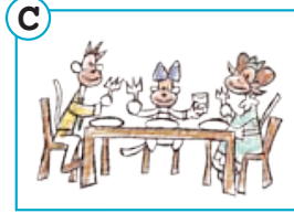
eat my dinner