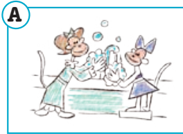
wash my hands