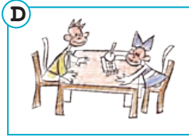
log my blood sugar