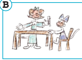
take my insulin