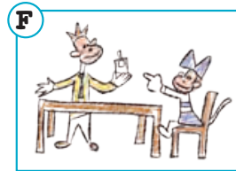
test my blood sugar