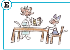
get my supplies